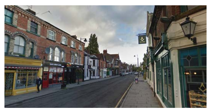
Lark Lane, Liverpool: A 'bohemian' high street with a good reputation, offering bars, cafes and restaurants. Some participants mentioned that they would like the high street in Garston to develop a night time economy.