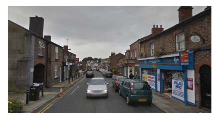
Allerton Road, Woolton Village, Liverpool: Located north east of Garston, the centre is a conservation area with a mix of restaurants, shops and housing. The area celebrates its historic buildings.