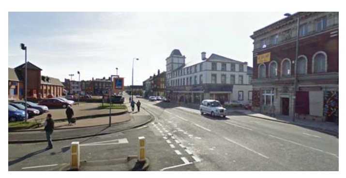
Walton Road, Kirkdale, Liverpool: A high street north of Liverpool City Centre offering a wide variety of independent shops and larger retailers.