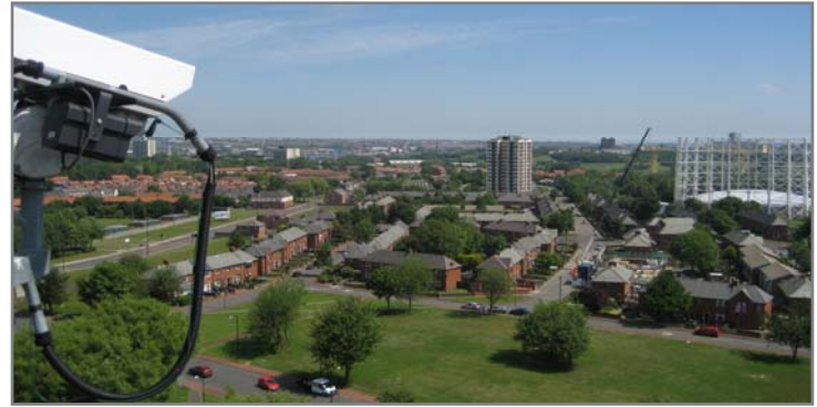
Views from St Anthony's

was developed to house the workers in the shipbuilding and engineering industries that once crowded its banks. Like many areas, it ended up with an over-concentration of similar looking inter-war terraced Council housing,