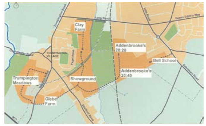
Above: Cambridge Southern Fringe Development Sites Image courtesy of Cambridge City Council Right: Northstowe Town Centre Square Image courtesy of Gallagher Estates