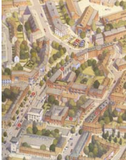
Indicative neighbourhood design for Harlow North