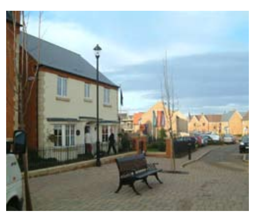
Kingsmead North, Milton Keynes