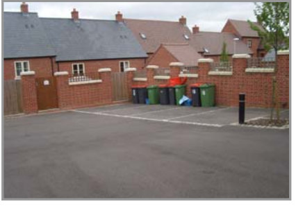
On street and courtyard parking at Ironstone