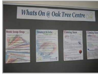
IT suite and details of some of the events run at the Lightmoor community centre