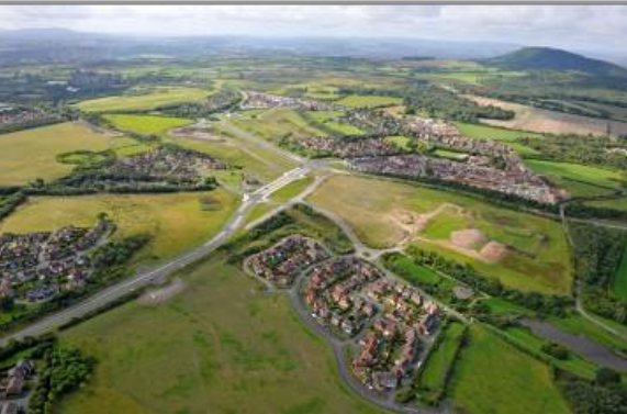
Birds eye views of Ironstone Lawley development site

planned for Telford during the period of the project. The scheme has a total value of circa £600m of which £75 million was in new infrastructure and reclamation (they