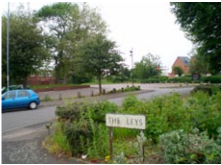
The Leys, carpark and leftover verge