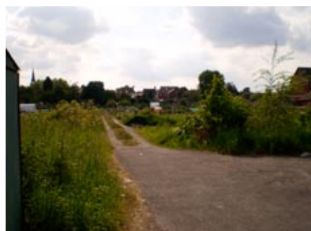
Allotments off Victoria Road