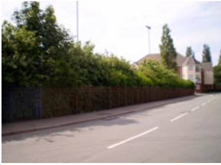
Hidden sports ground, Hall St