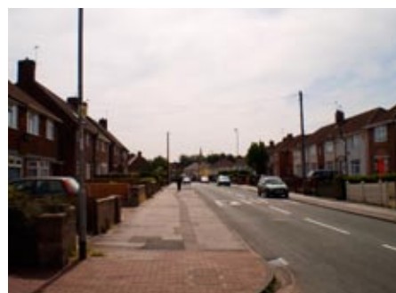
View back towards the spire of St Lawrence on Rough Hay Road

councillors saying how well the buses serve Darlaston, as they are the only real means of public transport on offer. On the other hand several responses raised questions over the reliability and quality of the bus service currently available.