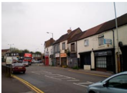
Pinfold Street and the derelict shop units