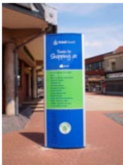
Recently installed signage on King Street