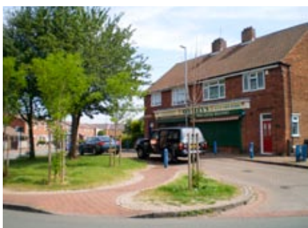
Local centre at junction of Rough Hay Rd and Hall Street