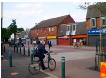
King Street and children playing