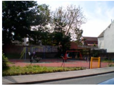
Playground, Whitton Street