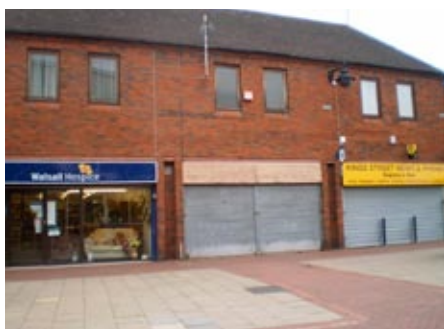
King Street and vacant units