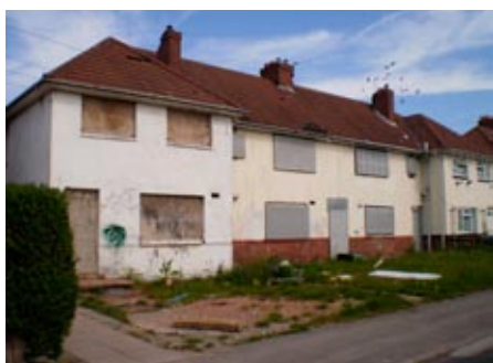
Boarded up semis on Lowe Avenue