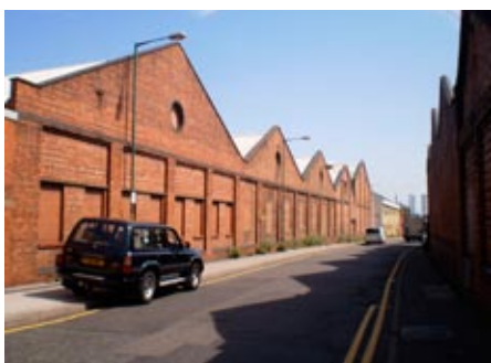
Factory Building, Station Street