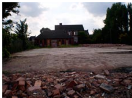
Half demolished leisure centre, Victoria Road