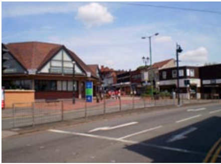
Library, King Street from south