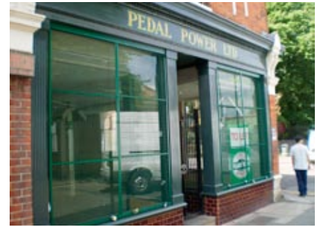
Empty unit in restored shop, Church Street