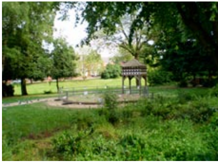
Dovecot in Victoria Park