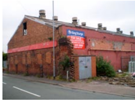
Former Factory for sale, Stafford Road