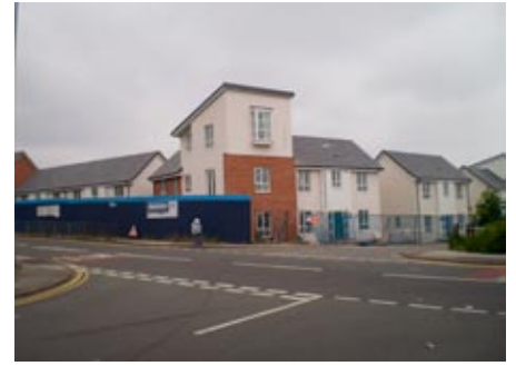
New housing on Willenhall Street