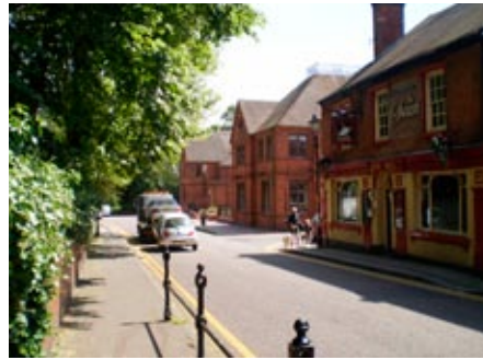
Town Hall and the Swan Pub on Victoria Road