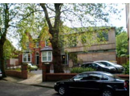
Surestart, Church Street