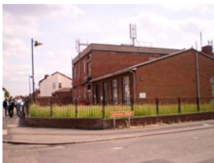
Vacant BT Exchange, Old Park Road