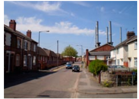
Station Street, mixed uses side by side