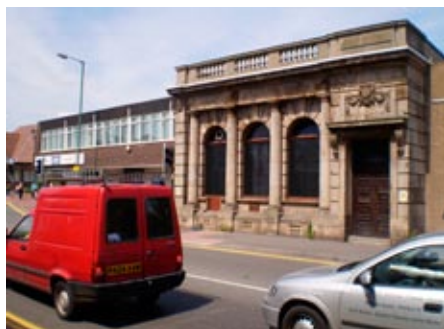
Bar (Former Bank) on Pinfold Street