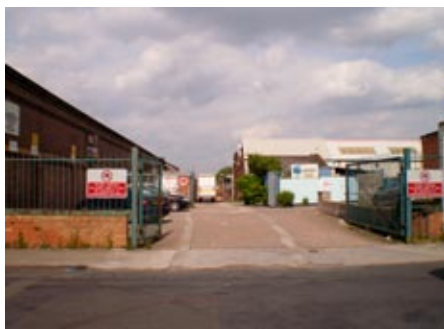
Factory gates opposite Whitton Street