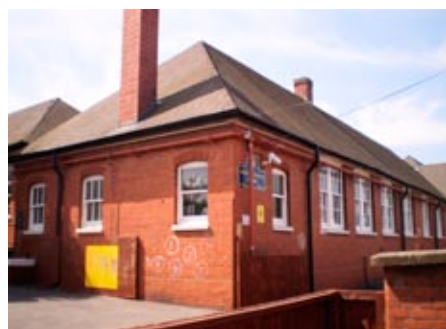
Salisbury School, Station Street