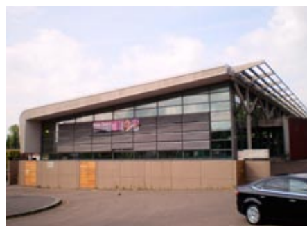
Darlaston Swimming Pool, Victoria Road