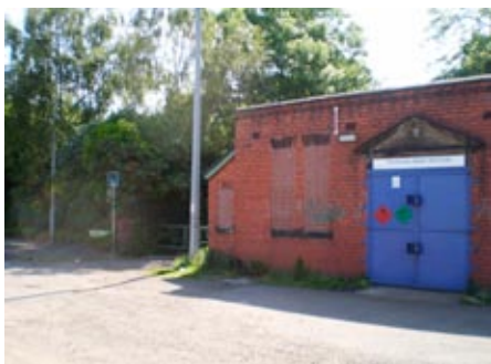
East entry to Kings Hill Park