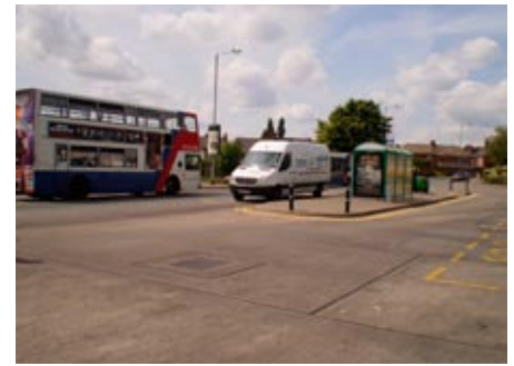
Darlaston Bus Station beside ASDA's carpark