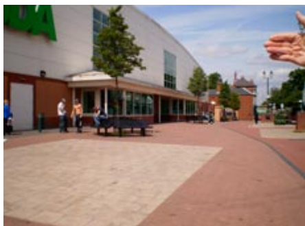
King Street and the ASDA facade