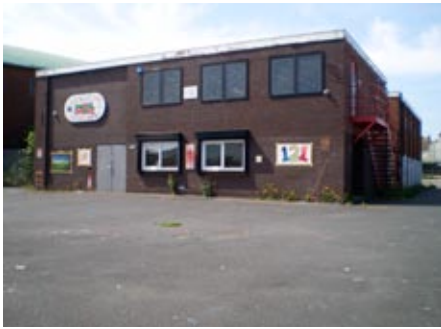
Youth Centre, Bill Street