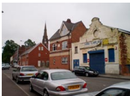
Mixed services on Church Street