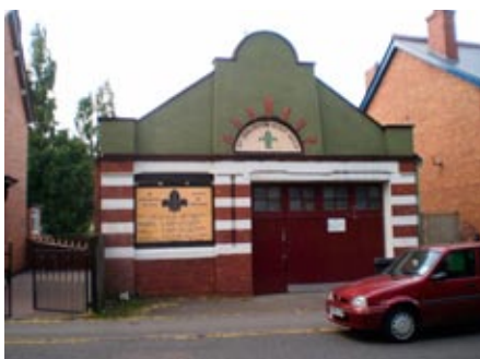
Scout hut, Victoria Road