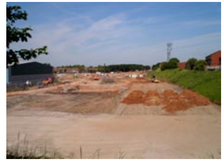
On site, large residential scheme by MarCity, Bloor Homes, Woden Road West