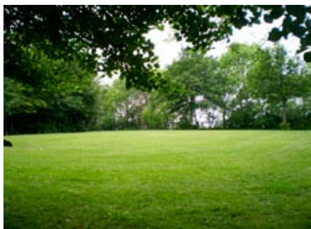
Secluded and hidden park on Kings Hill