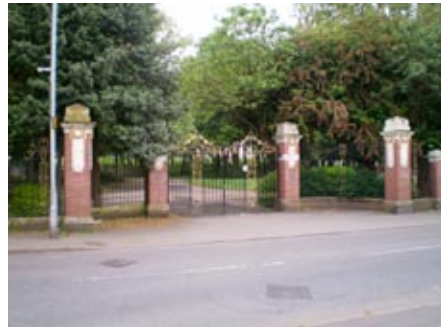
Gates to George Rose Park, Wolverhampton St