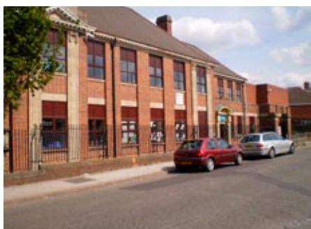
Kings Hill primary school, Old Park Road