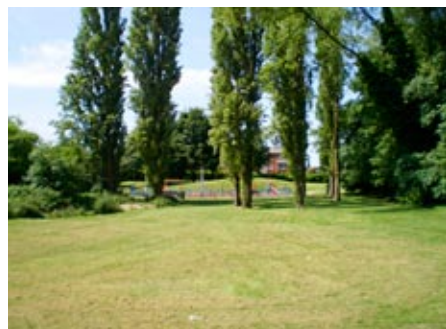
New playground to the west of Kings Hill