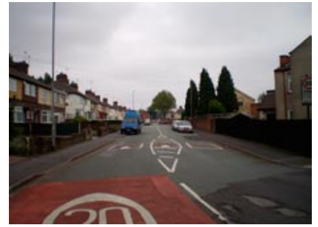
View up Stafford Road