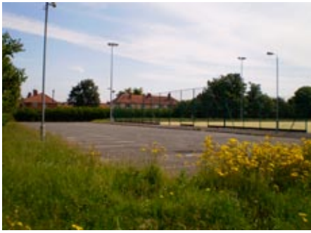
Locked up and empty sports ground, Hall St