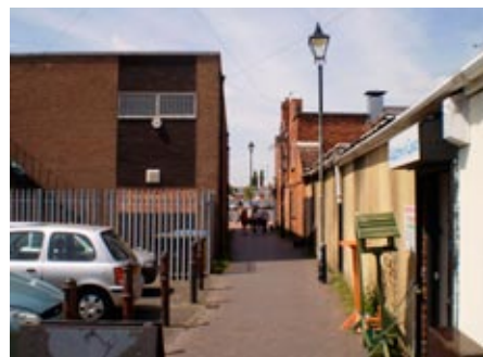
Side street off King Street