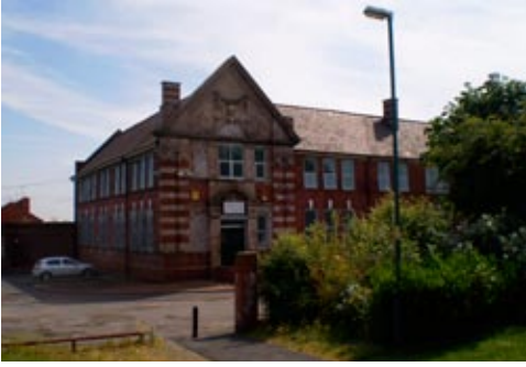
The Innovation Works @ Rubery Owen, Booth Street